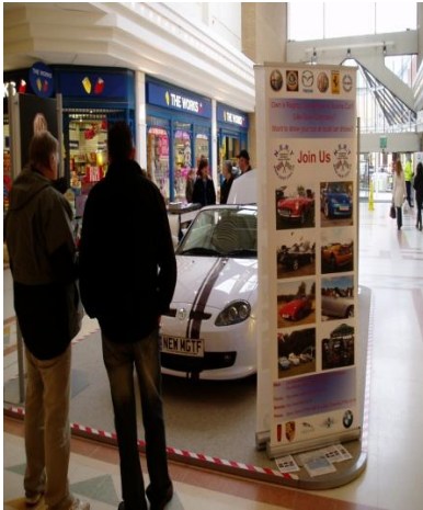
Its NERT birthday show being held at Gosfield Shopping Centre..."